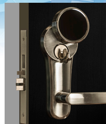
Swivelling keypad reveals concealed mechanical key access override.