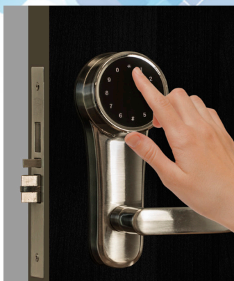
Multi-function, touch activated smart keypad and reader.