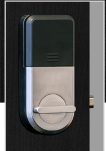
Inside latch & battery compartment