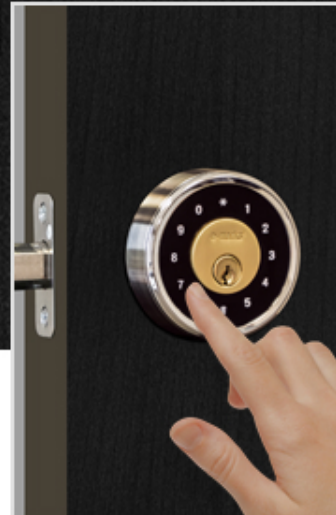
Touch activated PIN pad screen